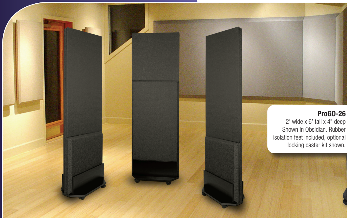
ProGO-26 2' wide x 6' tall x 4" deep Shown in Obsidian. Rubber isolation feet included, optional locking caster kit shown.